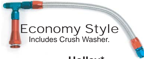
Economy Style Includes Crush Washer.