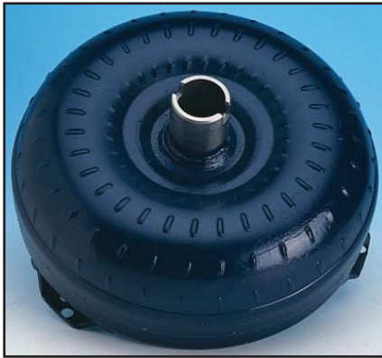
Note: Actual product may vary slightly from image.