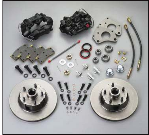
Image is a representation of kit. Actual parts will vary by application.